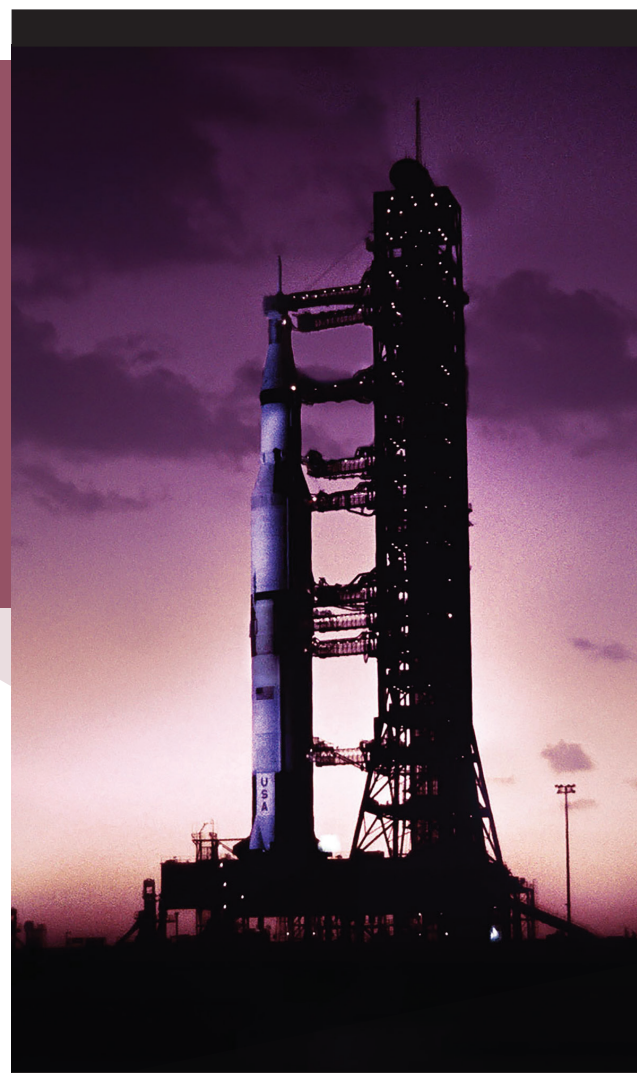
APOLLO 11 SHOWING APRIL 12-18

ART: VISIONS OF LIGHT by members of First Light Camera Club FEBRUARY 12 THROUGH MID-APRIL 2019